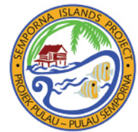
TAMAN MARIN TUN SAKARAN DARWIN INITIATIVE