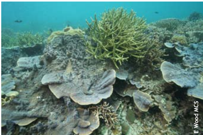
Dense and healthy hard corals in 1998