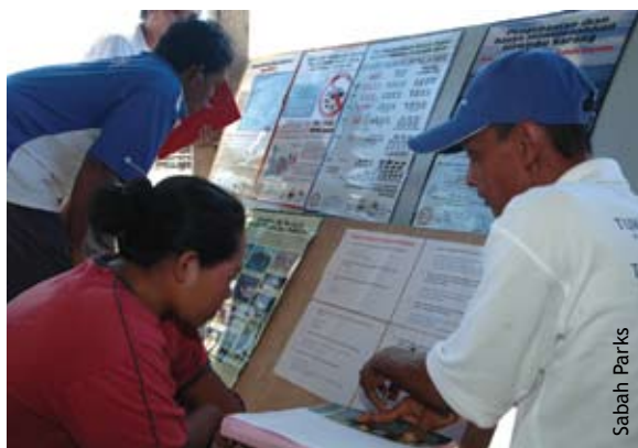
Posters and quiz being explained during the Roadshow

All the settlements in the Park were visited (12 kampongs plus scattered settlements on the Sebangkat reef top), together with 48 selected kampongs on the mainland and adjacent islands. The Roadshow also went to local government offices, army and police posts, local tour companies and a total of 10 schools.