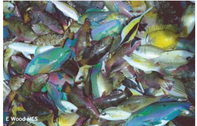
Even though fishermen may target certain families or species they usually keep whatever is caught and there is probably very little wastage.

The reefs in what is now the Tun Sakaran Marine Park (TSMP) have been over-exploited for many years and as a result, fish populations have dropped to a very low level. Urgent steps are now being taken to promote recovery by regulating marine resource use and introducing 'no-take' areas where fish populations can build up. As part of the monitoring programme to assess the effectiveness of these initiatives, SIDP has recently been collecting baseline information on current use and availability of fish species in the Park.