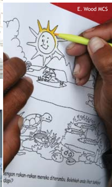
A specially designed cartoon colouring book produced for the Roadshow was popular with both children and adults.

The SIDP DVD was shown at each of the locations, and following this, the team invited people to get involved in the competitions and other activities and asked the adults to fill in a short feedback so that we could learn more about their knowledge of the Park and how often they visited it. Information posters and a copy of the regulations were left behind so that people had access to information about the Park at all times.