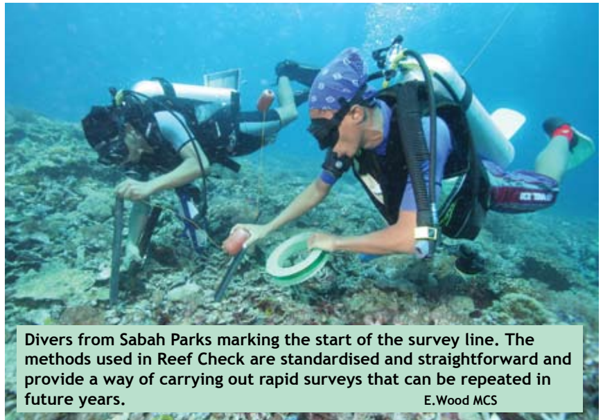
Divers from Sabah Parks marking the start of the survey line. The methods used in Reef Check are standardised and straightforward and provide a way of carrying out rapid surveys that can be repeated in future years.

Reef Check sites were established around the Bodgaya islands in 1998 during the first phase of the Semporna Islands Project, six years before the Park was gazetted. Since then they have been monitored by volunteers from the Marine Conservation Society in collaboration with Sabah Parks, and in March 2007 the four original sites and one 'new' site were surveyed during a Marine Science Expedition organised by Sabah Parks Marine Unit.