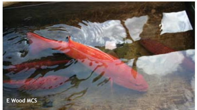
Species such as this coral hind Cephalopholis miniata are usually kept alive because they command a consistently higher market price than fresh fish.

The market price for fresh fish ranges from RM2-3 /kg for fish such as sprats and threadfin bream to over RM6/kg for some groupers, snappers and mullet. Very much higher prices are obtained for live fish, especially the humphead wrasse and mouse grouper, both of which are in short supply.