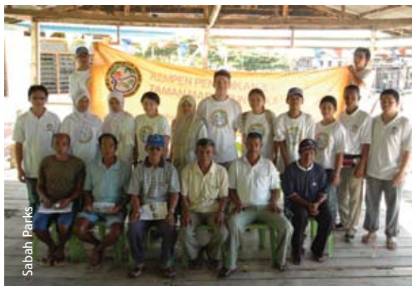
The Roadshow Team at Kg Selakan

Our aim was to ensure that people inside and outside the Park were aware of the regulations and understood the zoning plan. We also wanted to spread the message that fishing and harvesting of natural resources in the Park was going to be regulated and that permits were going to be required for tourist and other activities.